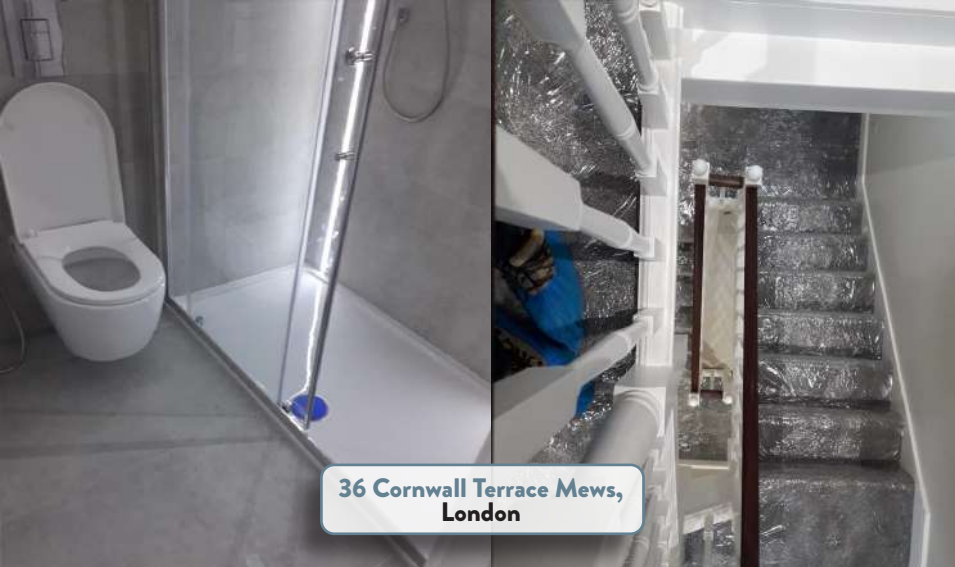
36 Cornwall Terrace Mews, London