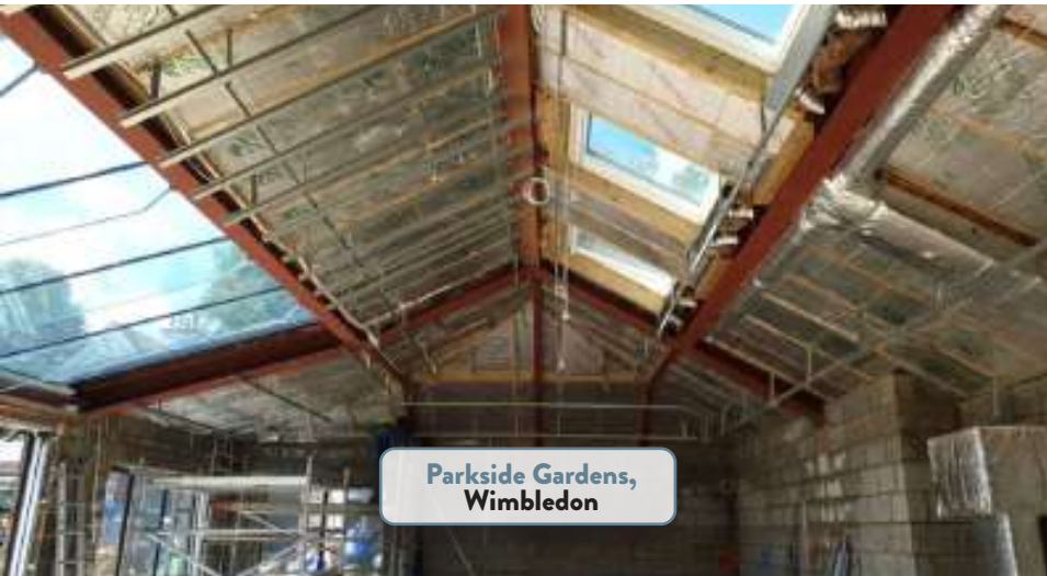
Parkside Gardens, Wimbledon