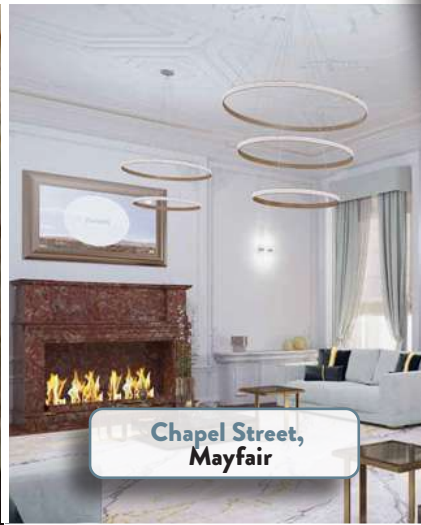
Chapel Street, Mayfair