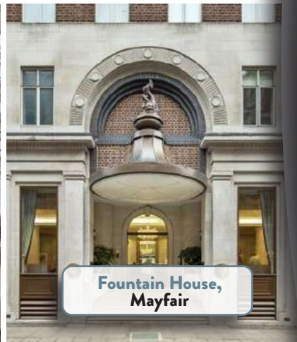
Fountain House, Mayfair