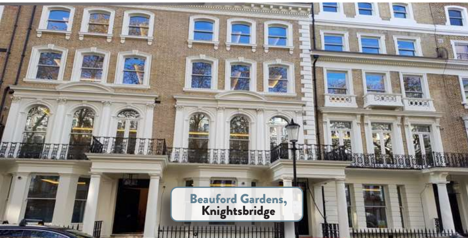
Beauford Gardens, Knightsbridge